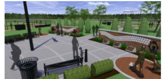
Memory Walls and Sculptures at Huber Village Park

Join fellow families and friends in supporting permanent reminders of our fun playing youth baseball and softball in the parks and schools of Westerville in the JBBL, JGSL and WYBSL