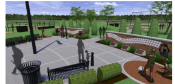
Memory Walls and Sculptures at Huber Village Park

Join fellow families and friends in supporting permanent reminders of our fun playing youth baseball and softball in the parks and schools of Westerville in the JBBL, JGSL and WYBSL