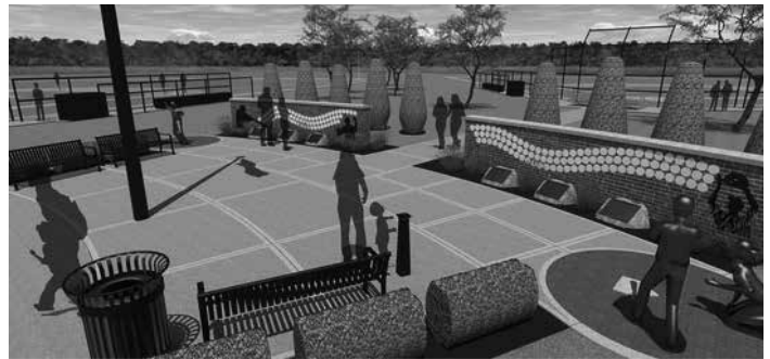
Huber Village "Memory Wall"