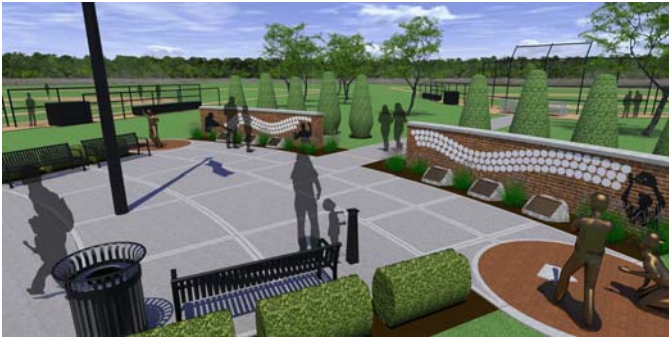
Memory Walls and Sculptures at Huber Village Park

In addition to the six sculptures to be installed, Huber Village Park will be the site of two Memory Walls (depicted in the picture below) representing the history and tens of thousands of players during the past sixty years – with a series of plaques (highlighting the history of youth baseball and softball in Westerville) and more than a hundred engraved, adopted “balls” dedicated to previous or current players and families.